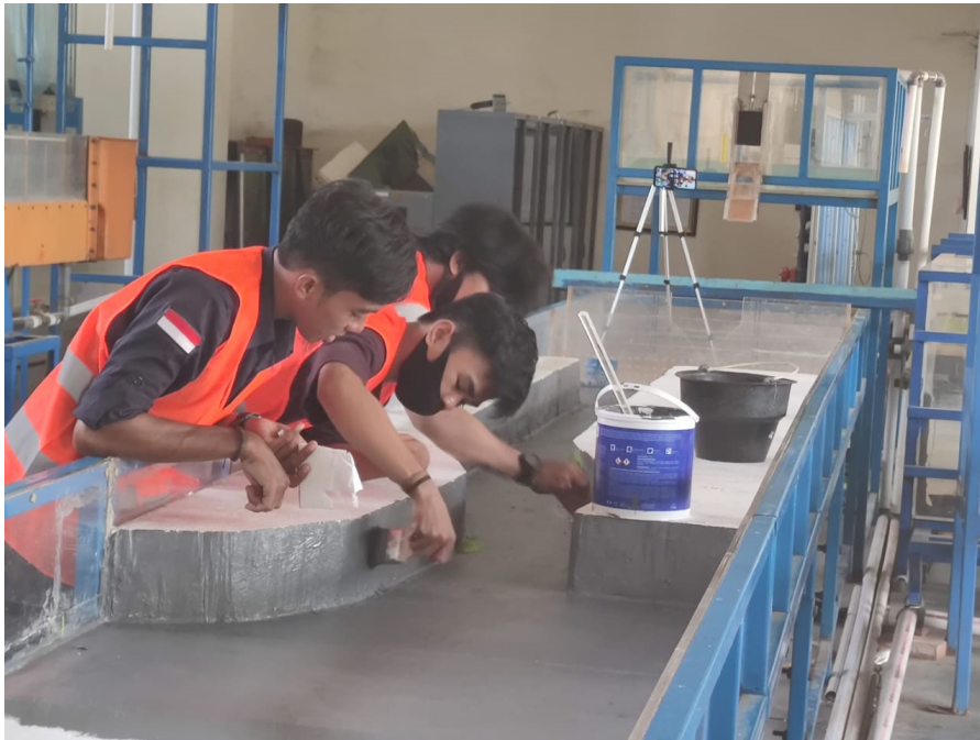
Figure 1. Set up research in laboratory